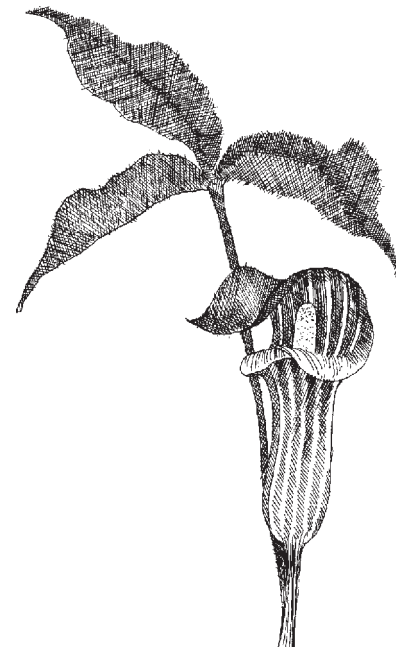
Jack-in-the-Pulpit found along the trails of Heritage Park in May

Spreading in a wave starting with SEEC and spreading throughout our county schools, "green living" philosophies will reach even further, as students and school employees bring their new learnings home with them. We will all be working toward the goal of environmental stewardship, which is to think globally, and act locally.